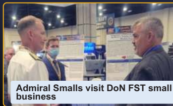
Admiral Smalls visit DoN FST small business