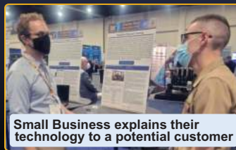
Small Business explains their technology to a potential customer